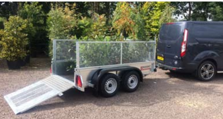
Optional aluminium treadplate floor covering.