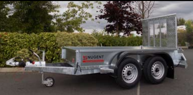
Manufactured with the Nugent trademark for durability and strength.