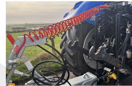
Air/Hydraulic Load Sensing Brakes