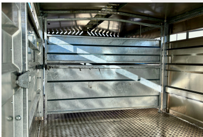
Double Latched, Full Width Dividing Gate