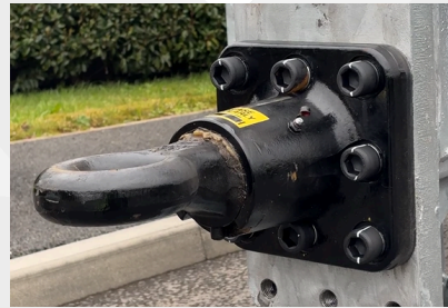
Bolt on adjustable swivel/spoon hitch