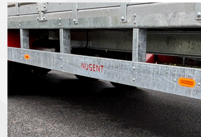
Crash Rails with Recessed Lights