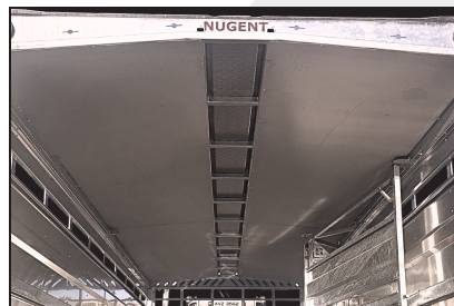
Fully Enclosed Roof