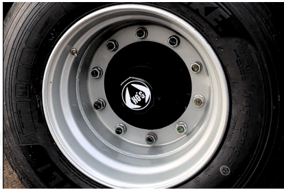
High speed 10 stud axles