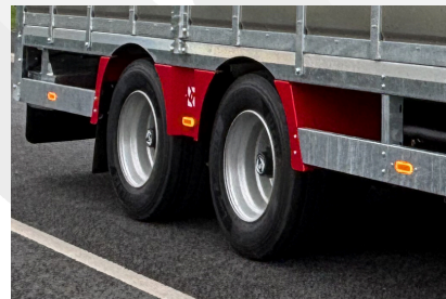
445/45 19.5 Inch Mini Super Single Wheels