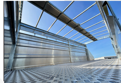
Open Roof with Catwalk