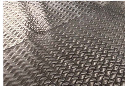
Fully Welded Aluminium Floor