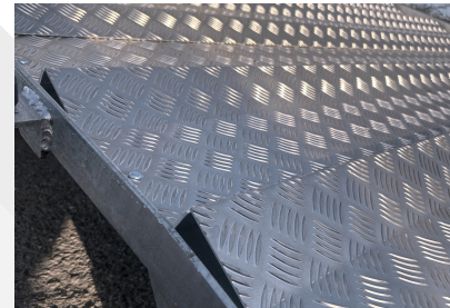
High Gripped Tail Door