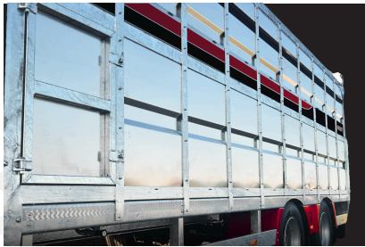
Fully Galvanised Structure