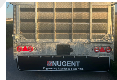
One Piece Rear Mudflap (Can be personalised)