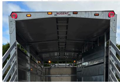
Strobe Marker Lights