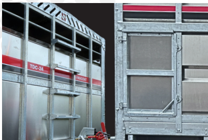
Front Inspection Ladder and Inspection Door