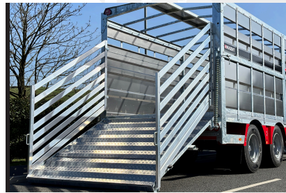
Heavy Duty Loading Gates With Handles