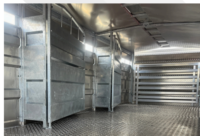
Safety Partition on Dividing Gate