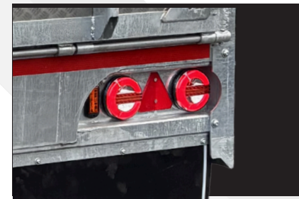
Dual Voltage - LED Lights